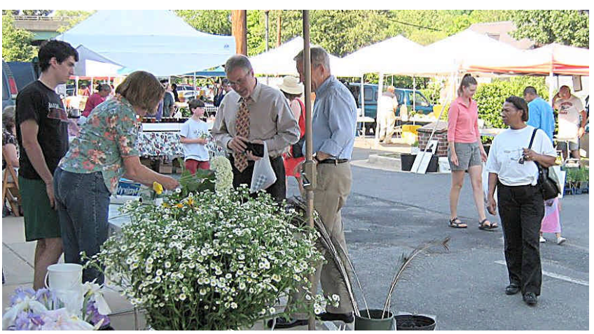
Riverdale Park Farmers' Market, June 2005.

To learn more about producer-only markets, visit www.tinyurl.com/9L7EY. For a list o f more markets, visit www.tinyurl.com/9JL3W